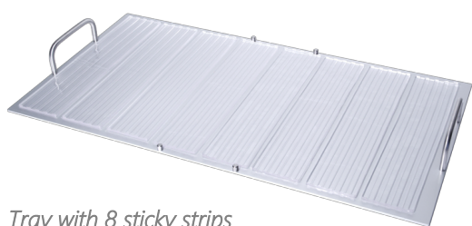
Tray with 8 sticky strips